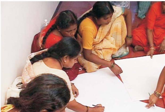
Members depicting their issues