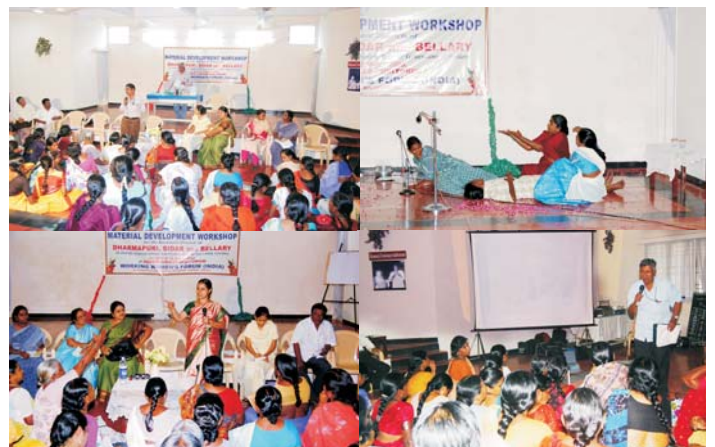
Members at the workshop

Prior to the workshop, the ground work to identify the problems/issues was taken up in co-ordination with the