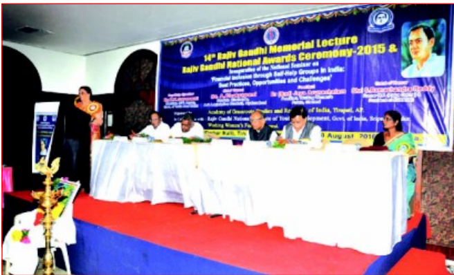
President WWF speaking at AGRASRI, Tirupati

Working Women's Forum (India)/Indian Cooperative Network for Women was invited to participate in the 14th Rajiv Gandhi Memorial Lecture where the Rajiv Gandhi National Awards Ceremony and the National Seminar also took place on August 20 - 21, 2016 at Tirupati. This function was organized by the Academy of Grassroots Studies and Research of India (AGRASRI).