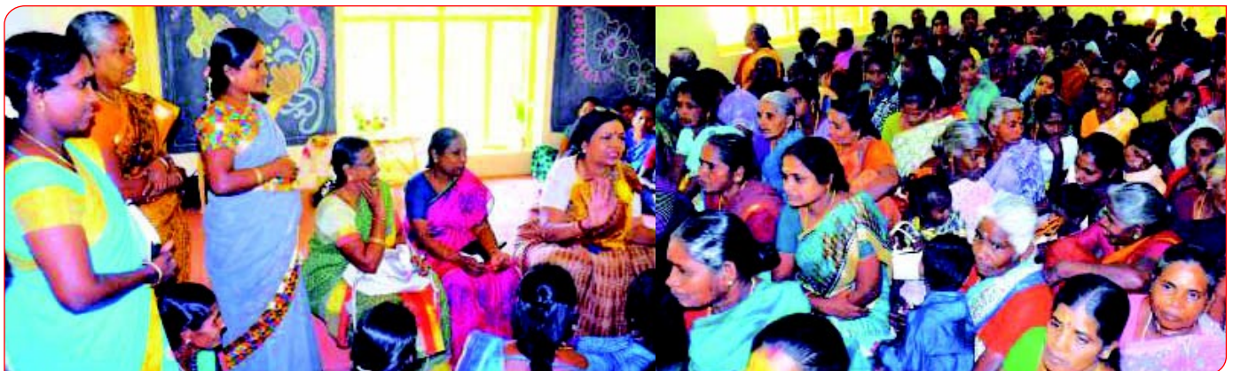
President ICNW interacting with the members at Adiramapattinam