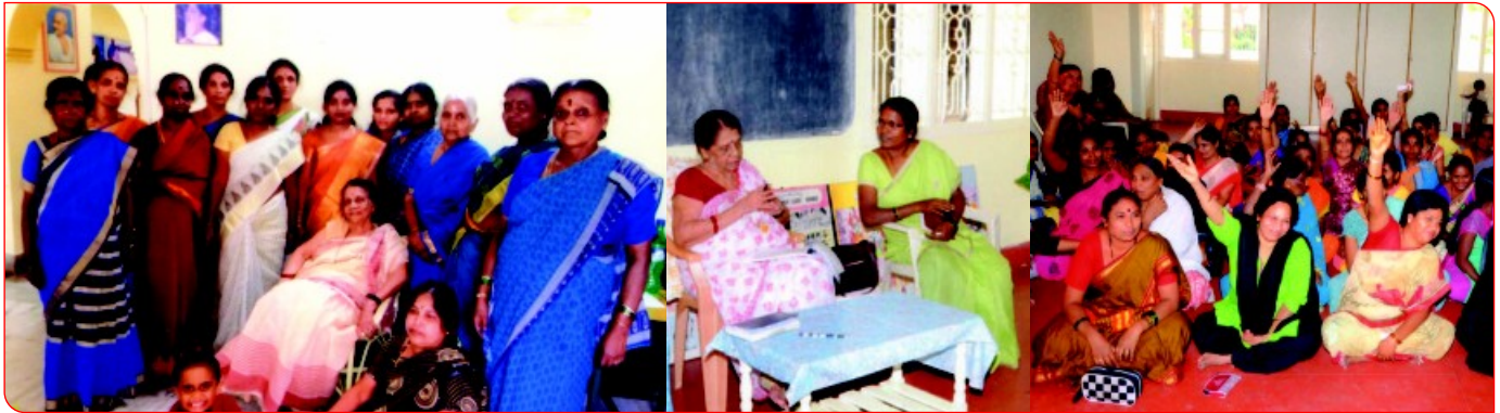
President WWF's interaction with the members of Karnataka branches

WWF, asked the staff to increase the membership. Besides she also enquired about the performance of the organizers. Similarly, a meeting was held at Bidar branch on November 18, 2016 where over 30 women entrepreneurs attended the meeting. While interacting with the member's, the President, WWF enquired the members view about the demonetization process. The response of the members was not very encouraging. The members said that the prices of essential commodities have increased. Even the common salt which is hardly Rs.20 are being sold for Rs.200 per kg in those areas and it's not easy to buy essentials for small amount unless they buy for higher amount.