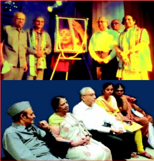
Dr. Karan Singh at the Triplicane Cultural Academy