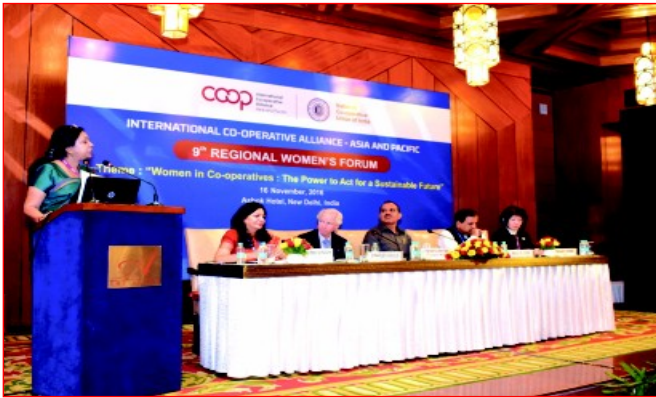
President ICNW as Vice President ICA-AP Women's Committee delivering the vote of thanks

of Women Committee. The opening ceremony was attended by over 700 delegates from India and the region. Mr. Radha Mohan Singh, Union Minister for Agriculture and Farmers Welfare and Mr. Suresh Prabhu, Union Minister for Railways, Government of India grace the occasion. Mr. Parshottam Rupala, Minister for State for Agriculture and Farmers Welfare addressed the closing ceremony.