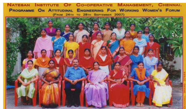
WWF/ICNW Staff at refresher training programme

details on the involvement of the people in various programmes by adopting techniques like skits, making charts, mind games, queries were posed and feed back elicited. The workshop facilitated poor clients to improve, plan and manage the financial aspects of their income. The training was very interactive and participatory as it not only trained the participants how to deal with the poor clients but also how the Forum can adopt the techniques to the local environment and implement them practically.