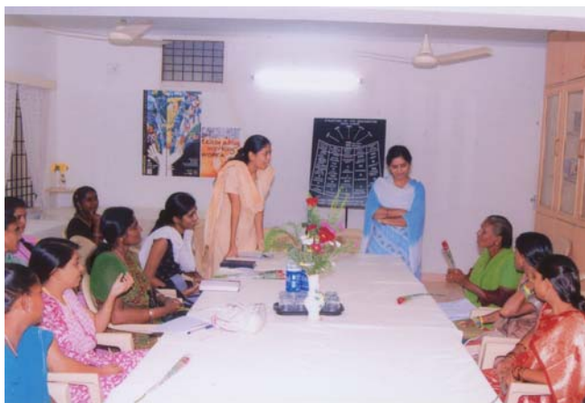
Interaction with the World Vision Team, Bhopal