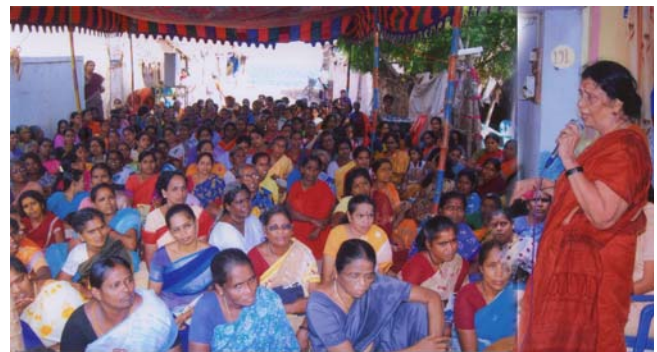
President addressing mass meeting in Chennai

As Review and Mass Meetings are a regular feature in the Forum, the mass meetings were conducted in the areas on 11, 12, 15 and 16 October 2007 in Chennai. The President visited the Chennai branches, i.e. North, South and Central Chennai and addressed nearly 8000