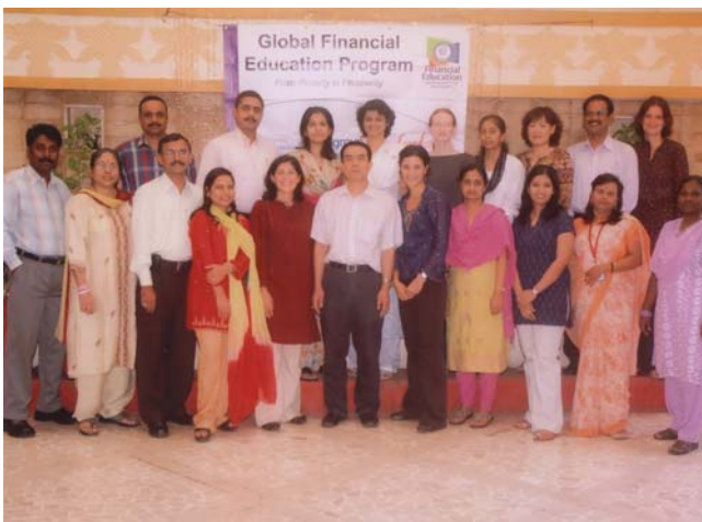
Training of Trainers Programme in Mumbai

To keep abreast of the latest banking procedures in the current scenario, the staff from ICNW/WWF attended the five-day refresher training programme at Natesan Institute of Co-operative Management from 24 to 28 September 2007 . Around 30 staff from various branches of WWF attended the training programme. The course covered aspects on accounting procedures, stress reduction through yoga, emotional equilibrium besides motivation, computerization process and included a field visit.