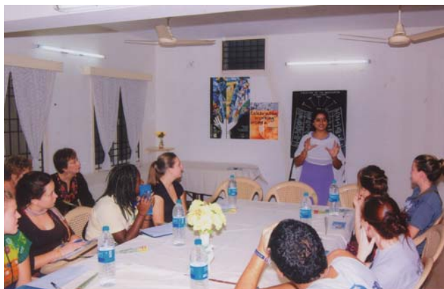
Orientation programme with Semester at Sea Students

queries relating to the Forum's work/activities. Apart from these details they were also interested